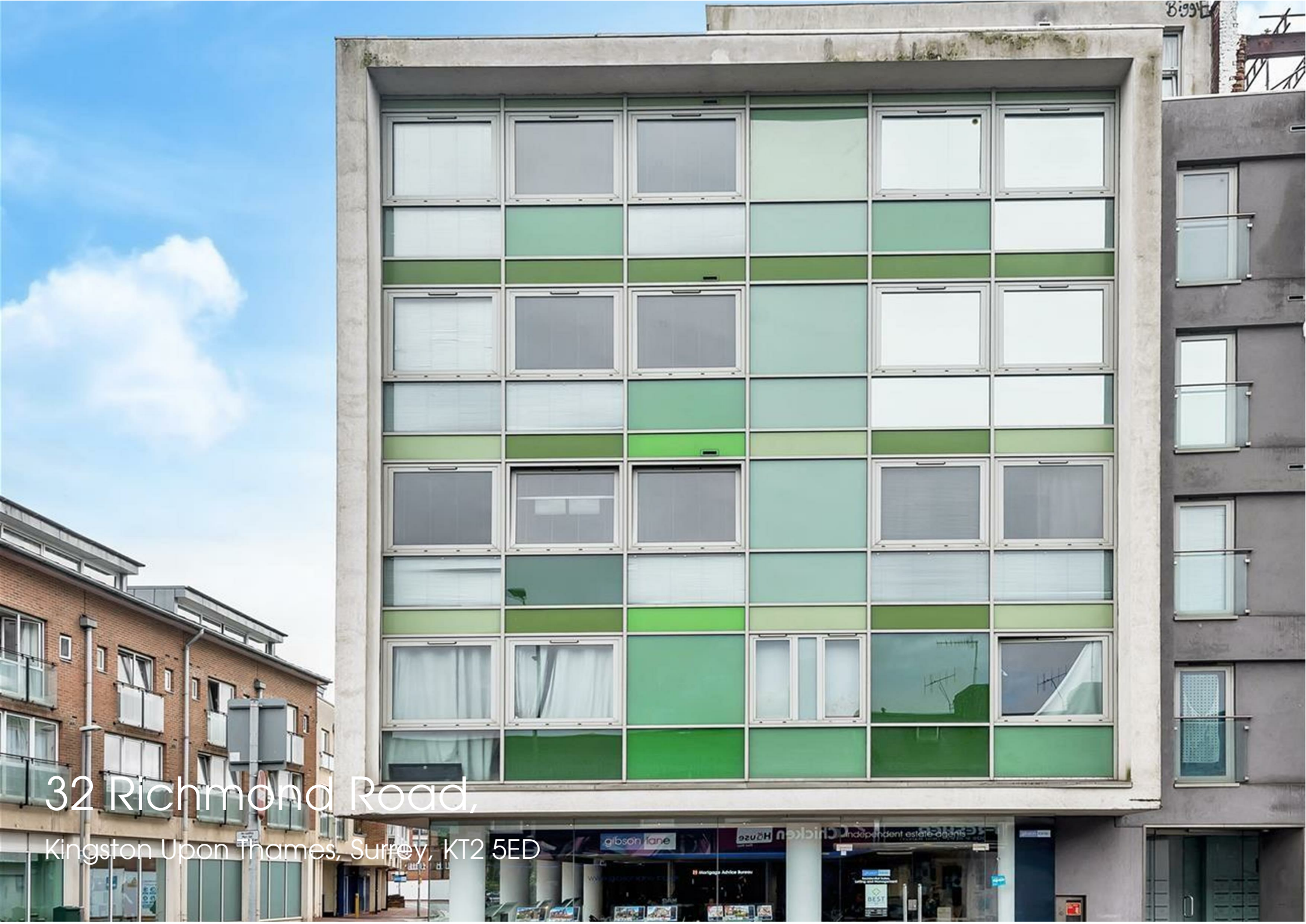
32 Richmond Road, Kingston upon Thames, Surrey, KT2 5ED